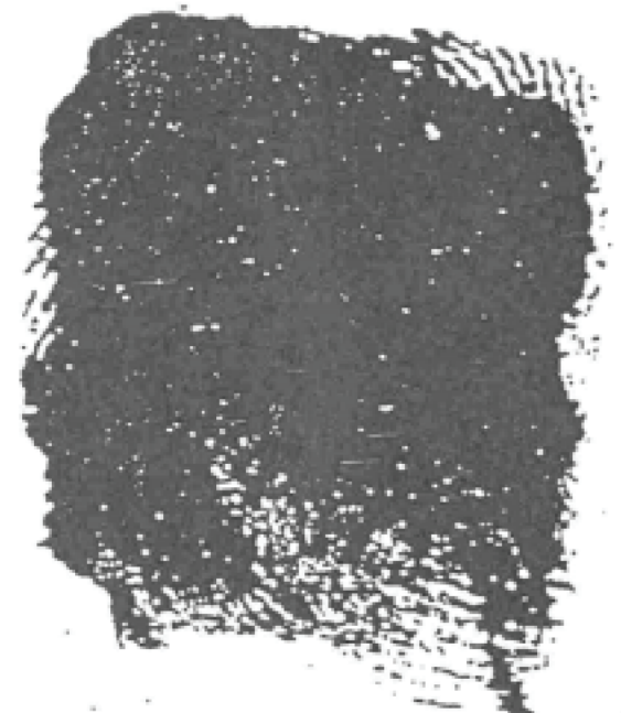
Print Too Dark

Take straight-down from first joint to tip.