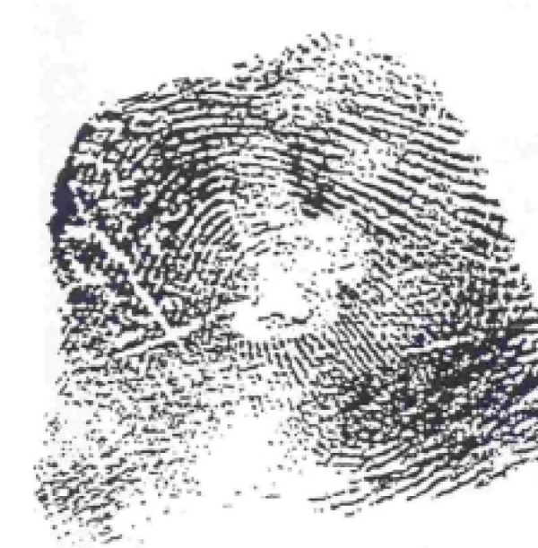
Excessively Dry (Worn Ridges)

Ensure ink and pres- sure is evenly distribut- ed.