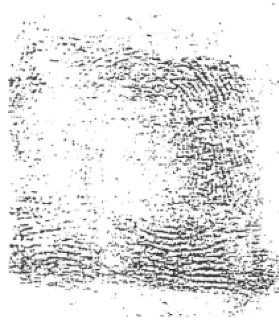
Print Too Light