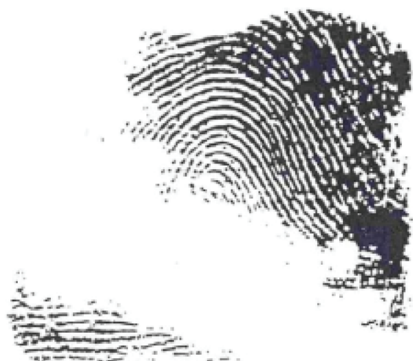
Ink Unevenly Distributed

Dry OR wipe finger with alcohol, ink and print one finger at a time.