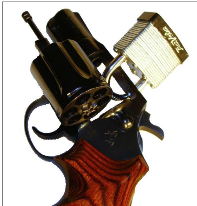
Figure 6: Padlock around top strap

You have many options for securing your weapon. You can individually lock up weapons using gun locks, or you could purchase a lock box or safe that can hold multiple guns. Different models offer different levels of security. For example, there’s an obvious difference between a sheet metal lock box and a 500-lb gun safe. Use a secure storage method that meets the needs identified in your family’s safety plan, discussed next.