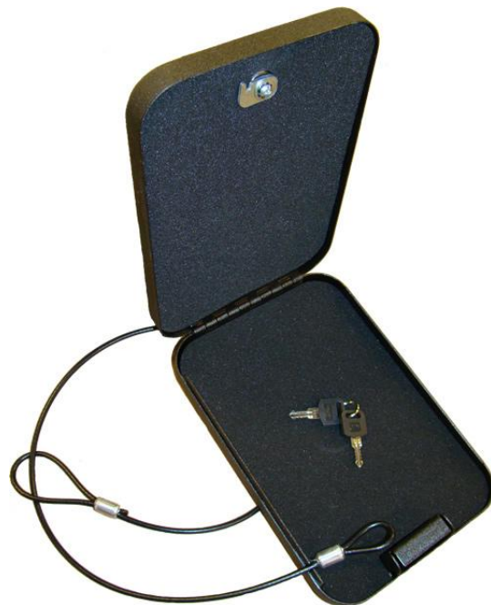
Figure 10: Portable Lock Box

On the other hand, a gun left in the glove box might be carelessly handled by passengers or children. Examples of Wisconsin children obtaining weapons from glove boxes have already been provided. Furthermore, a gun in a glove box is easily stolen. For example, on June 11, 2016, three pistols were stolen from three unlocked vehicles in just one Wisconsin community. 19 Another Wisconsin community saw at least three handguns and an AR-15 stolen from unlocked vehicles in just a few weeks. 20 Even locked vehicles can have valuables stolen via “smash-and-grabs.” 21