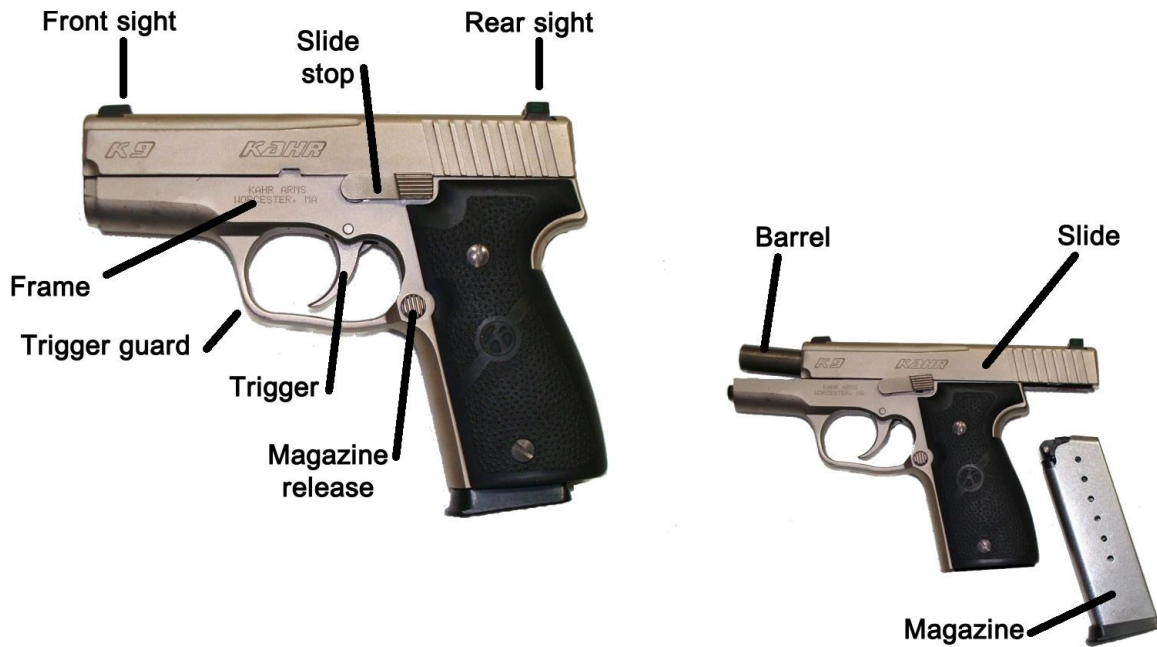
Figure 3: Semi-automatic pistol

Pistols contain cartridges in two locations: the barrel's chamber and a detachable magazine. If a user does not follow the correct sequence when unloading a pistol, a cartridge may remain in the chamber even when the magazine is removed.