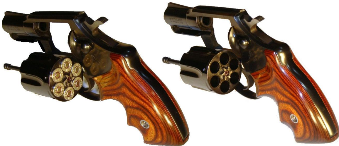
Figure 2: Loaded and unloaded revolver