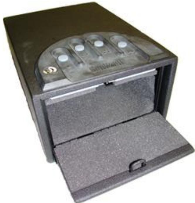
Figure 8: Rapid access lock box

To securely store an unloaded pistol, you may place a cable lock through the empty magazine well and ejection port. This prevents insertion of a magazine and prevents the slide from closing. It also allows the pistol to be securely locked to an immovable object (Figure 7). Many Wisconsin law enforcement agencies offer free cable locks through Project ChildSafe. 7 Another alternative is disassembling the pistol and placing a padlock through the slide's ejection port.