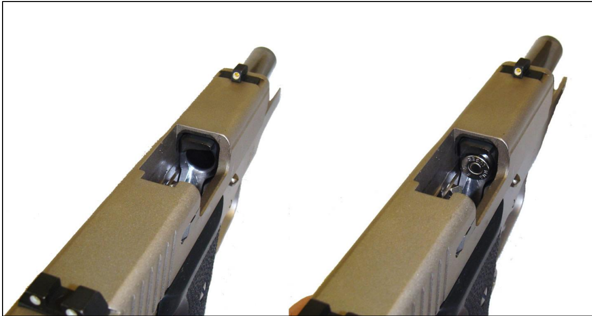
Figure 4: Chamber empty (L); cartridge remains in chamber (R)