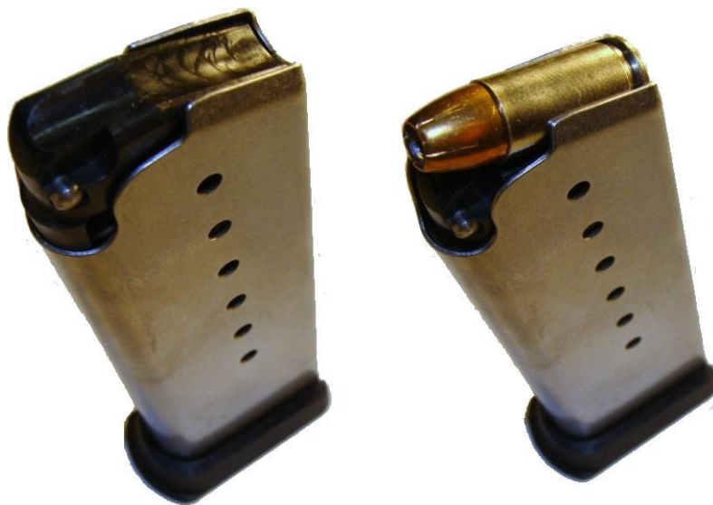
Figure 5: Unloaded (L) and loaded (R) magazine

Pistols may or may not have a manual safety. Safeties are usually small levers or buttons that, when activated, block the firing mechanism. Some safeties also prevent the slide from moving. Safeties are mechanical devices that can malfunction, fail, or be inadvertently deactivated. Never rely on them. Users must always follow all the fundamental rules of firearm safety even when a safety is activated.