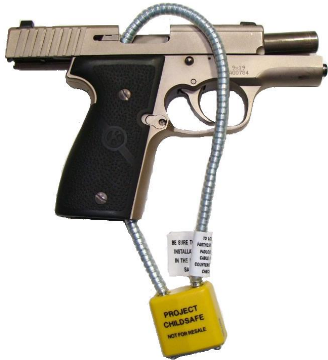
Figure 7: Pistol with cable lock

There are many types of locks that can help you store individual weapons safely. Trigger locks are designed to block access to the trigger and prevent the gun from being fired. Cable locks can block the gun's action and prevent it from being loaded. Lock boxes are designed to prevent access by persons without the key or access code. Keep the keys with you to ensure the weapon cannot be accessed.