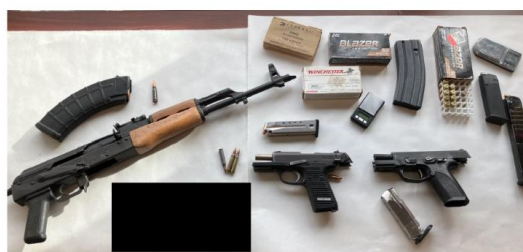
Left: Recovered narcotics. Center: 3D printer. Right: Recovered firearms.